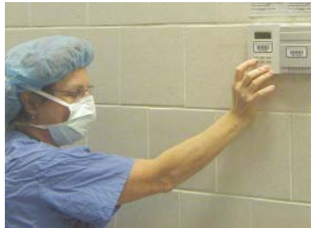
The Smart Sensor provides medical staff a convenient way to adjust room temperatures.

"One of the security department's challenges at MEEI is its diverse list of responsibilities," adds Beaudry. "The future plan is to include web access, so that security personnel on the move will be able to have immediate access to the TAC access/security system."