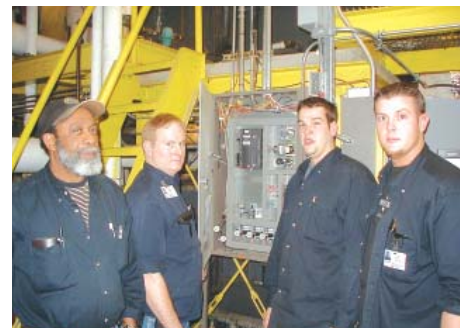
MEEI's HVAC Technicians standing next to a Continuum BACnet control panel