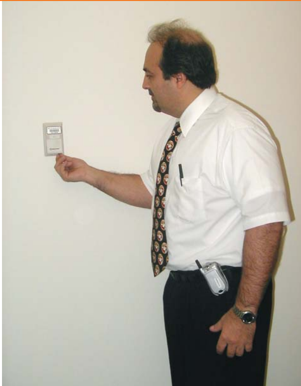
The Smart Sensor provides facilities staff a convenient way to adjust room temperatures.