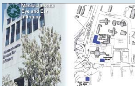
CyberStation Home Page with aerial view of MEEI's campus